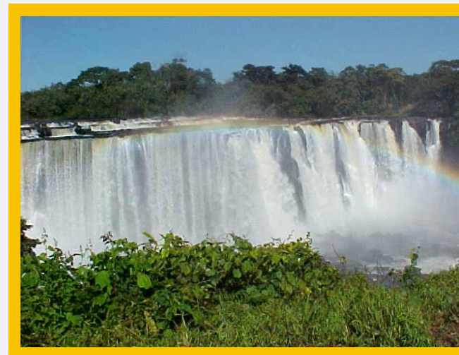
Lumangwe Falls at its peak

The major tree species are Brachystegia taxifolia , Brachystegia utilizes , and Brachystegia bussei . Others include Jubernadia paniculata , Jubernadia globiflora and Isoberrlinia angolensis . The riparian vegetation include species like Bridelia micrantha , Berlinia giorgii , Uapaca kirkiana and Syzygium quineense . The falls are formed at the point where the underlying rocks consist of undifferentiated sand stones and metamorphosed sedimentary rocks of the Katanga series. The rock strata comprise dolomite, quartzite, slates and limestone with occasional of outcrops of various intrusion rocks.