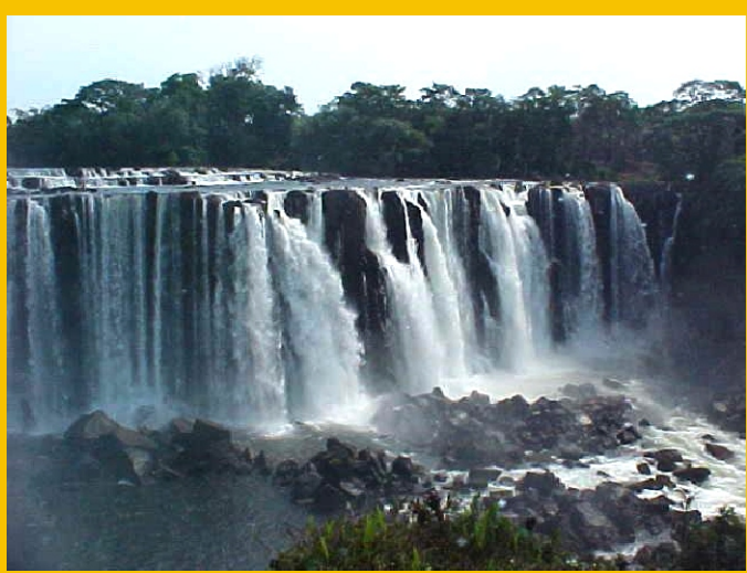
Lumangwe Falls at low flow

Lumangwe Falls is situated on the Kalungwishi River on the borders of Kawambwa and Mporokoso districts though in Mporokoso district of Northern Province of Zambia about 84 kilometres from Mporokoso district and 2 Km east of Chimpempe pontoon. The exact geographical location is latitude 9 degrees 31 minutes and longitude 29 degrees 22 minutes east.