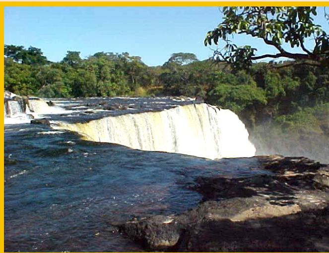
Lumangwe Falls above the water fall

Lumangwe Falls is a nationally significant water resource worth of declaration as a National Monument because of having exceptional value or quality illustrating or interpreting the geological and ecological themes. Apart from simply the natural beauty found in its falling water, Lumangwe site has abundant flora and fauna some only endemic to this part of Zambia. It forms part of the domain in the study of natural history and palaeontology besides its aesthetical attraction.