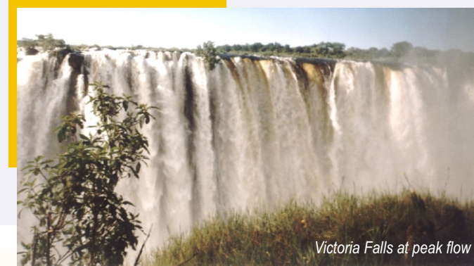
Victoria Falls at peak flow

The Lumangwe Falls is a miniature Victoria Falls, the smoke that thunders and therefore the second most attractive waterfalls after Victoria Falls. See picture of Victoria Falls below