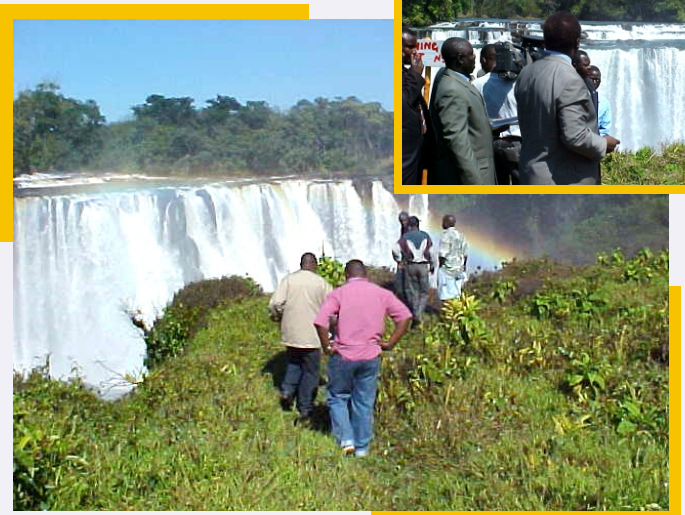
Visitors at Lumangwe Falls

The Lumangwe Falls is of some grandeur being thirty metres high and over a hundred metres in width. They nourish a small rain forest. It covers an area of 65 hectares and the miombo woodland is the most prominent physiognomic unit within the vicinity of the site.